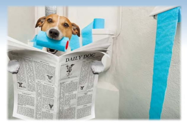
Figure 1 - Potential Layout Design of New Facility